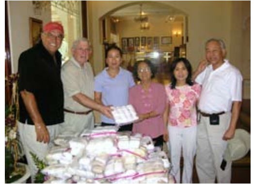
D.O.V.E. Fund delegation members delivering bandages in Saigon, March, 2008